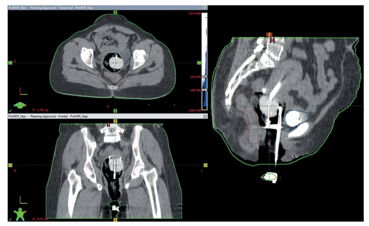
Fig. 4. Multiplanar CT images of combined packing technique

a non-compliance rate of 20%, forty-four patients were planned for recruitment in the study. The sample size was calculated using PS: Power and sample size calculation version 3.0, Vanderbilt. P -value of < 0.05 was considered statistically significant.