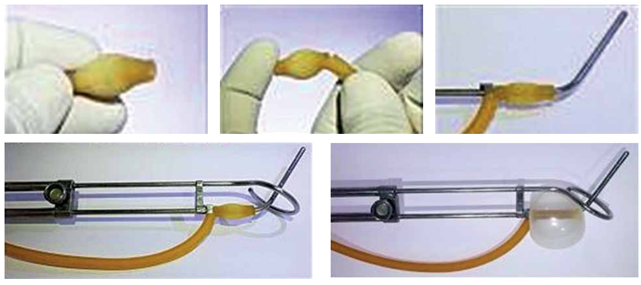
Fig. 2. Preparation of Foley's catheter and threading onto tandem

Fig. 1. CONSORT diagram. Comparison of vaginal gauze packing technique with or without balloon used in high-dose-rate brachytherapy of uterine cervical cancer: a cross-over randomized controlled trial